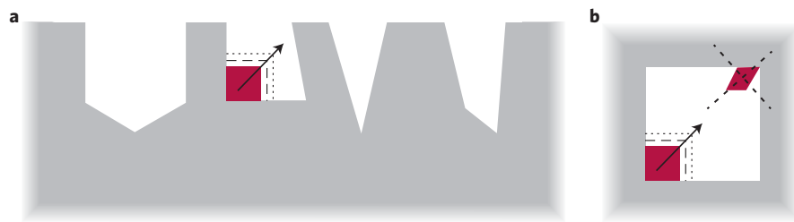
Figure 2 | Nucleation of crystals (red) in porous surfaces (pores, white; surface, grey). a , In a disordered, porous or pitted material, the large variety of pore sizes and shapes makes it highly probable that the nucleus of any polymorph will fit almost perfectly into at least one pore. b , In square pores, a cubic crystal is expected to nucleate faster than a triclinic polymorph (which has no right angles) because a cubic nucleus better fits into the right-angled corners of the square pores.

to fit the nucleus of the cubic polymorph (Fig. 2b). Conversely, the nucleus of a triclinic crystal would be a poor fit to pores with right-angled corners because the crystal would need to incorporate either strain or defects. As a consequence, right-angled pores